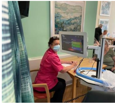
Playing an interactive footie game in Bodlondeb. Goal!!